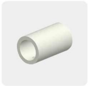
03.Pole Tenon Adaptor