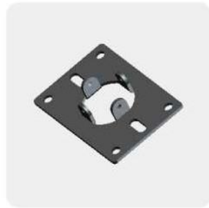
04.Square Pole Adaptor